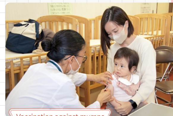
Vaccination against mumps

Fujioka City is an excellent environment for raising children with the entire community, including child-raising support from the time of pregnancy, careful checkups and support for infants, securing places where children can feel comfortable after school, and educational continuity from primary through lower secondary levels based on community schools.