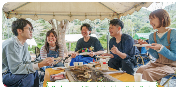
Barbecue at Tsuchi to Hi no Sato Park

Completed in 2021, the park features a water fountain where you can enjoy playing in the water and a 24 meter-long membranous trampoline called fuwafuwa-dome, making it a perfect playground for children. In the event of a disaster, it can be used as a place for the emergency evacuation for citizens, a logistics base for emergency relief goods, and a site for temporary housing.