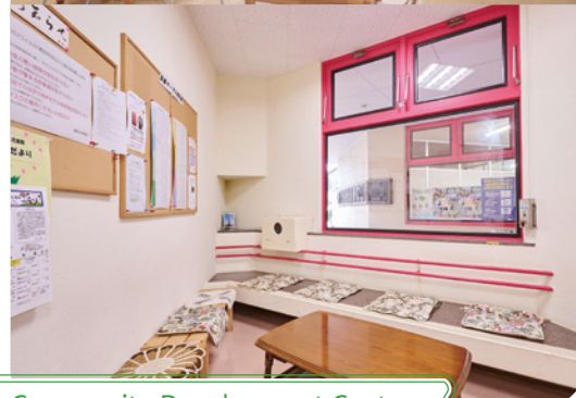
Community Development Centers

Community Development Centers are facilities where people voluntarily gather, meet, and enjoy activities. The city has eight facilities, which play a role in fostering people-to-people connections and strengthening community ties.