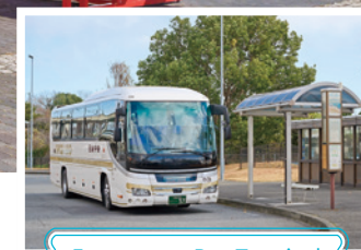
Expressway Bus Terminal

Laran Fujioka Roadside Station adjoining Fujioka Interchange of the Joshin-Etsu Expressway is a popular spot with a fountain plaza in its center, souvenir shops and restaurants, tourist information, a mini amusement park with a Ferris wheel, and an expressway bus terminal.