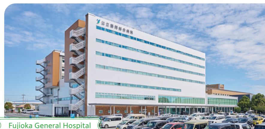
Fujioka General Hospital

It is a general hospital with a variety of roles, including general practice, emergency medical practice, and highly specialized care. We are working to improve our medical system to meet local medical needs.