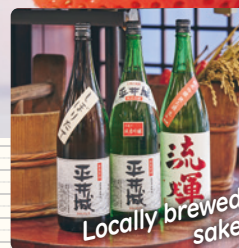
Locally brewed sake