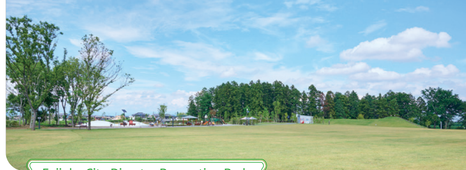
Fujioka City Disaster Prevention Park

Completed in 2021, the park features a water fountain where you can enjoy playing in the water and a 24 meter-long membranous trampoline called fuwafuwa-dome, making it a perfect playground for children. In the event of a disaster, it can be used as a place for the emergency evacuation for citizens, a logistics base for emergency relief goods, and a site for temporary housing.