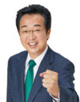
Masahiro Arai, the Mayor of Fujioka City

Fujioka City, blessed with a rich natural environment of flowers, greenery and clear streams, has the remains of Takayama-sha, one of the properties that make up the Tomioka Silk Mill and Related Sites, which is on the UNESCO World Heritage List, and has many historical sites from the Stone Age and the Kofun Period. As shown by these sites stated above, the city developed into a place where people and things have come together actively since ancient times. Today, approximately 90 km from Tokyo, the city serves as a junction of the Kan-Etsu Expressway and the Joshin-Etsu Expressway, as well as an important automobile traffic hub adjacent to the Kita-Kanto Expressway.